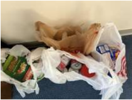
Lenten Food Drive—Thank you to all who donated!