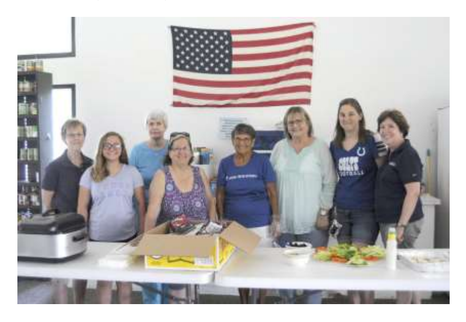
Just a few of the many volunteers at MUMC!

In need of a meal or know someone who could benefit from this program? Summer lunches are served Monday through Friday from 11 a.m. to 1 p.m. at the pool house in the Candlewood Subdivision on Prairieview Road. Candlewood Estates, 808 N Prairie View Rd, Mahomet, United States.